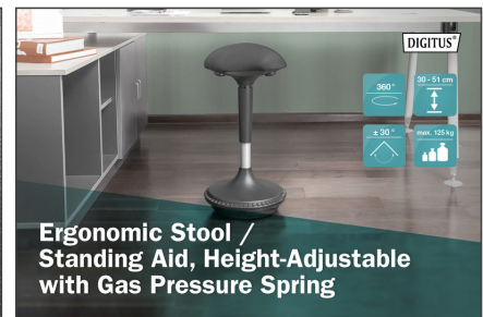
Ergonomic Stool / Standing Aid, Height-Adjustable with Gas Pressure Spring