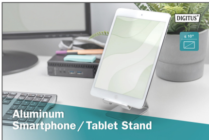
Aluminum Smartphone / Tablet Stand