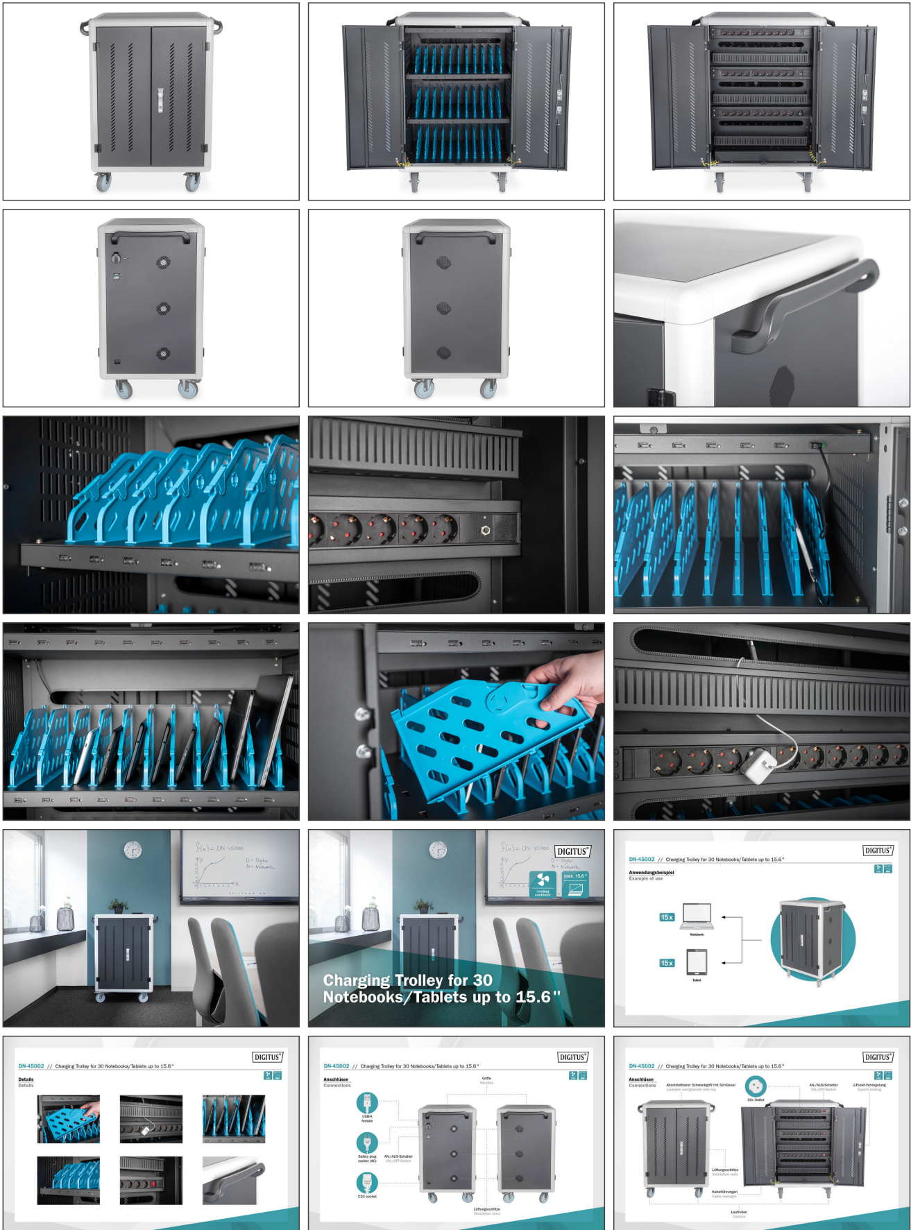
Charging Trolley for 30 Notebooks/ Tablets up to 15.6"