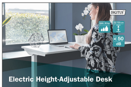
Electric Height-Adjustable Desk