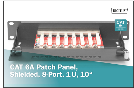
CAT 6A Patch Panel, Shielded, 8-Port, 1U, 10"