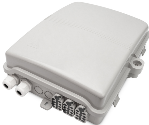
Outdoor FTTH Distribution Box for 24x SC/SX or LC/DX adapters and 24 splices