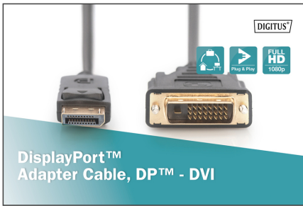
DisplayPort™ Adapter Cable, DP™ - DVI