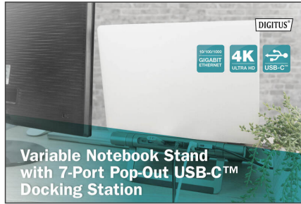
Variable Notebook Stand with 7-Port Pop-Out USB-C™ Docking Station