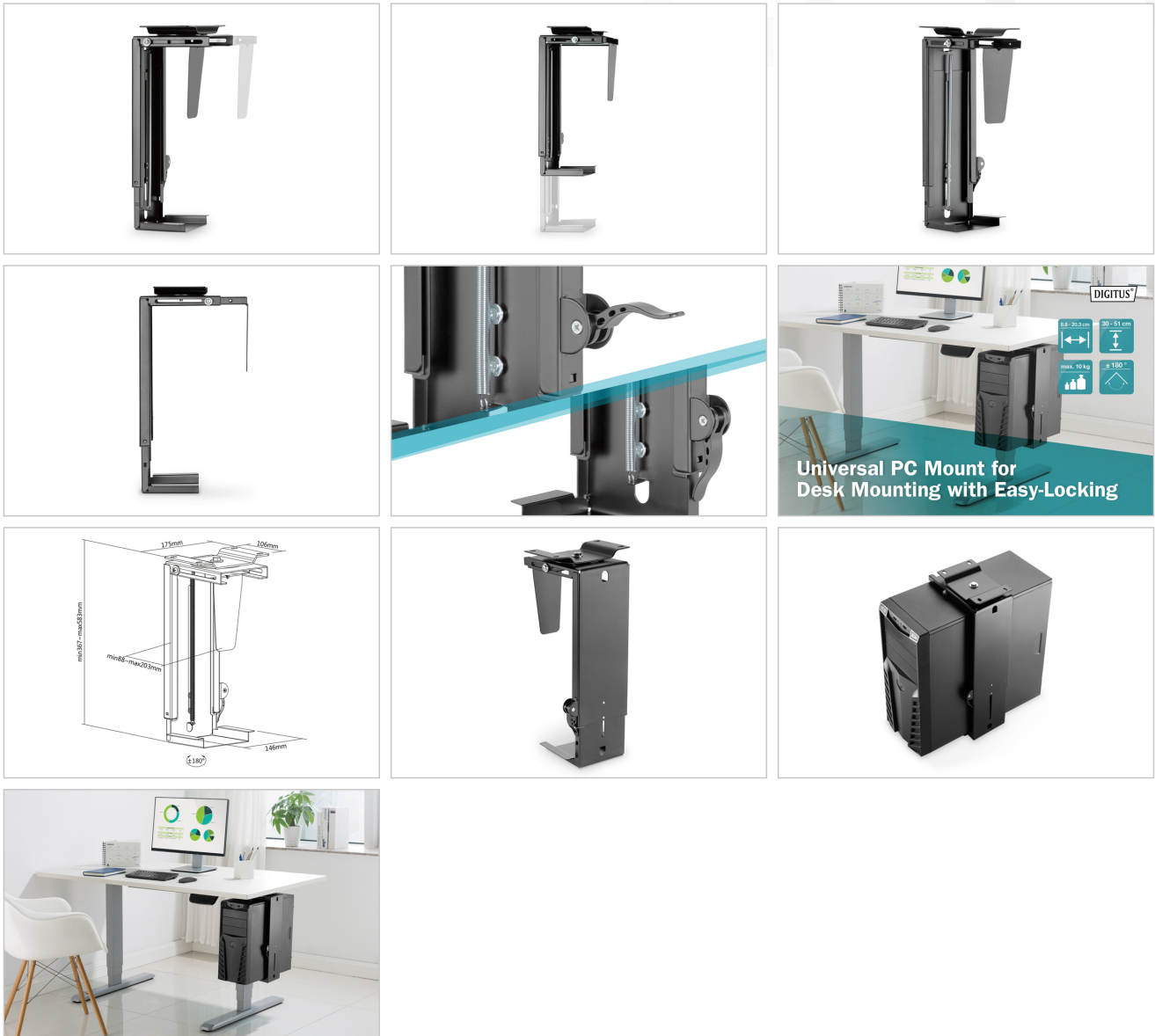
Universal PC Mount for Desk Mounting with Easy-Locking

DIGITUS 6.5-20.5cm 50-51cm max. 9kg ±180°