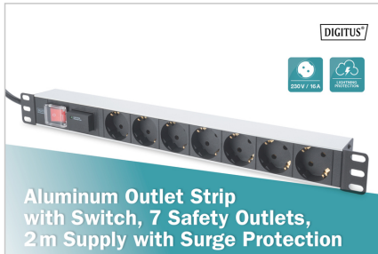
Aluminum Outlet Strip with Switch, 7 Safety Outlets, 2m Supply with Surge Protection