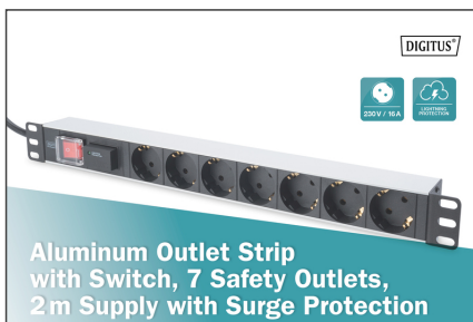
Aluminum Outlet Strip with Switch, 7 Safety Outlets, 2m Supply with Surge Protection