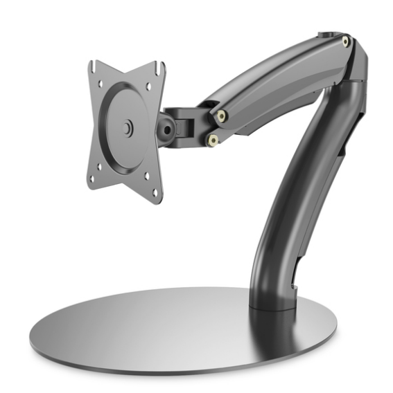
Table stand for LCD/LED monitor up to 27" flexible gas spring mount, max 6,5kg, VESA 100x100

The universal table stand allows you to install LED and LCD monitors of all brands, in sizes up to 69 cm (27"). The gas spring arm allows you to adjust your monitor to whatever height you like. Simply note the VESA size and the weight of your monitor in order to select an appropriate table mount.