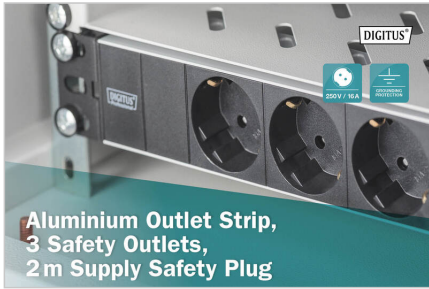
Aluminium Outlet Strip, 3 Safety Outlets, 2m Supply Safety Plug