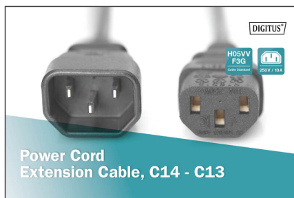
Power Cord Extension Cable, C14 - C13