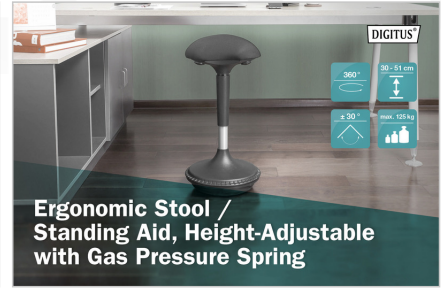
Ergonomic Stool / Standing Aid, Height-Adjustable with Gas Pressure Spring