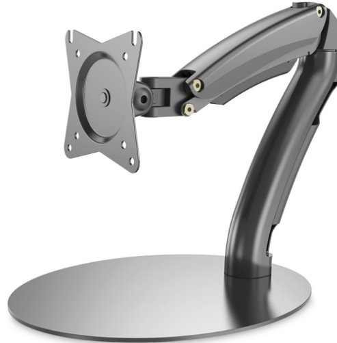
Table stand for LCD/LED monitor up to 27" flexible gas spring mount,max 6,5kg, VESA 100x100