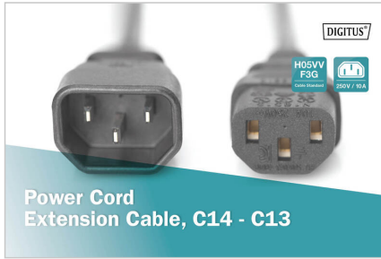
Power Cord Extension Cable, C14 - C13